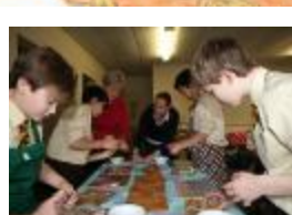
(right) Our NURSERY gave us the perfect Christmas preparation during 'Christingle'