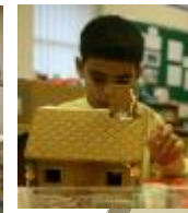
(above) Nursery, Yr. R, Yr 1; (left) Yr. 2, Yr. 3; (below) Yr. 4, Yr. 5 & 6